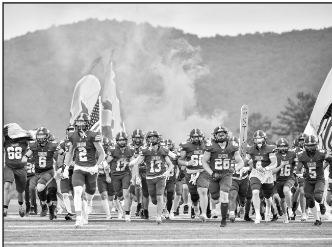
The Panthers take the field ahead of Friday night's game vs. Fannin County.

that positive momentum go- will continue getting better and ing, but we're glad we have taking it one practice at a time. and they're coming off their another home game and we If we do that, I think the results first victory of the season. have an opportunity to redeem will begin trending in the right