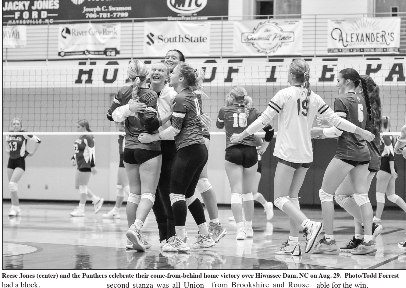
had a block

Panthers 3, Hiwassee Dam 2 (23-25, 25-13, 15-25, 25-12, 15-11) - Union County rallied from a 2-1 deficit to take the final two sets at home on Thursday, Aug. 29.